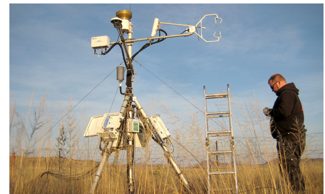
Technician maintaining the Thünen GHG measurement tower in the Karoo/South Africa

agri benchmark , a global network of agro-economists, advisors, and producers, provides analyses to improve productivity, sustainability and competitiveness. Already 15 African countries cooperate in this network, which is led by Thünen Institute of Farm Economics .