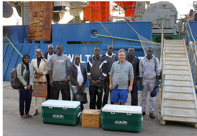
Thünen scientist and African students in front of research vessel Walther Herwig III